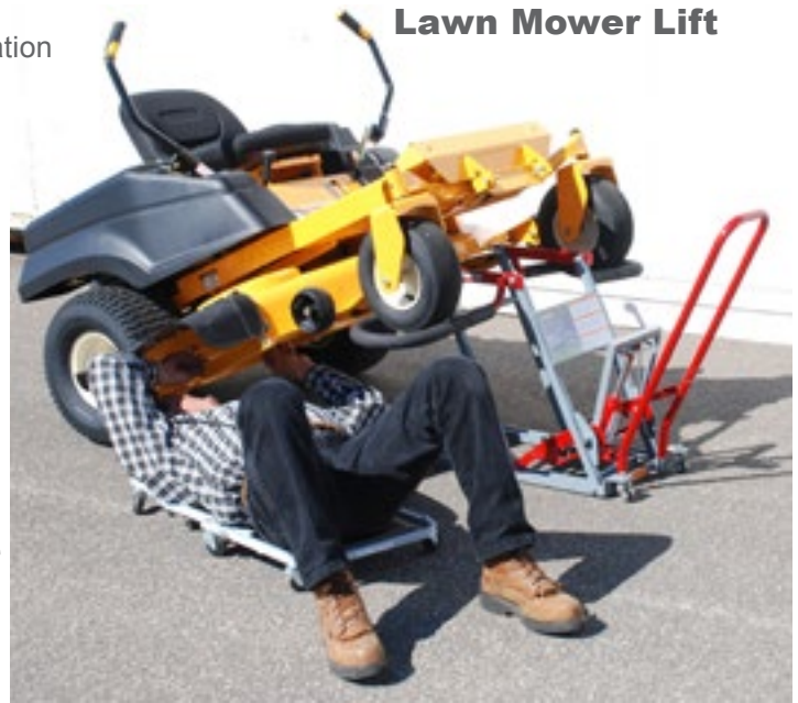
Lawn Mower Lift