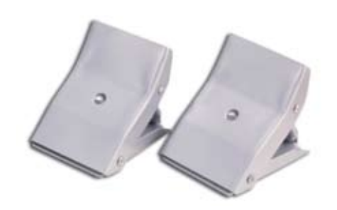
T-8074 Wheel Chocks Foldable design for compact storage