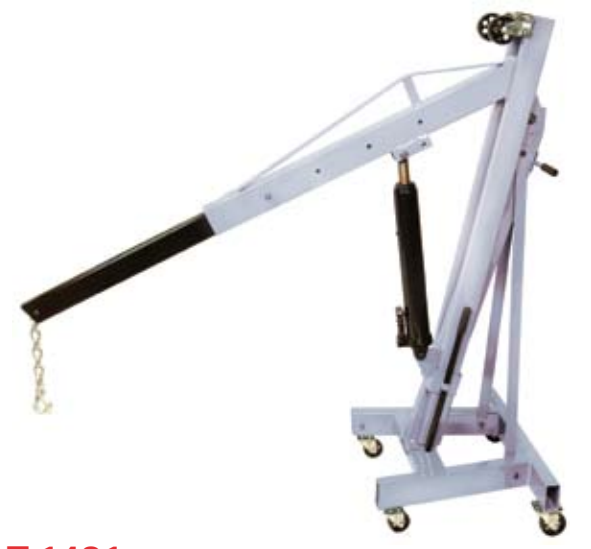
T-1481 2 Ton Foldable Engine Crane