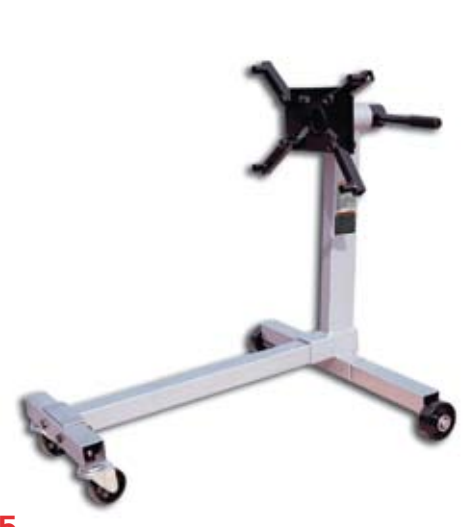
T-1085 750 Lb. rated capacity Engine Stand