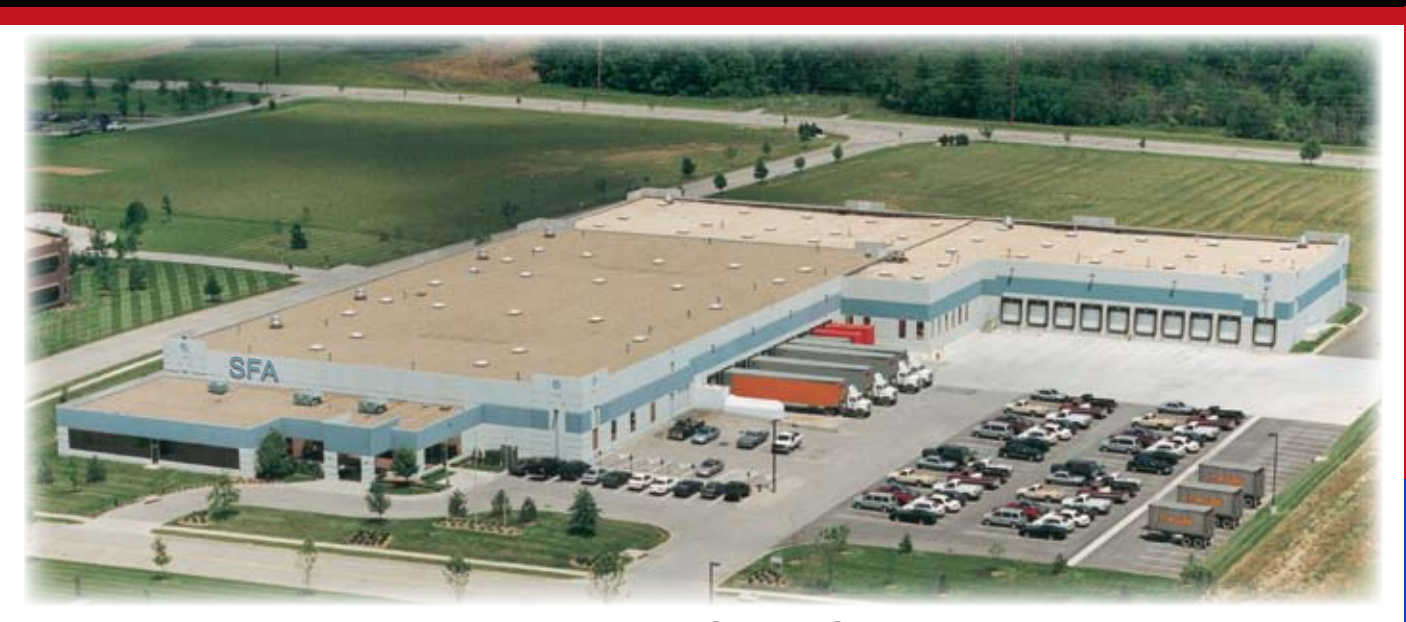
Kansas City, MO Manufacturing, Sales, Marketing, Engineering and Distribution