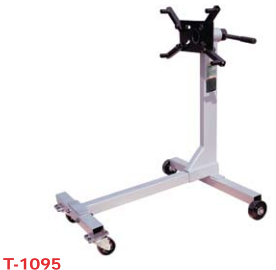
1,000 Lb. rated capacity Engine Stand