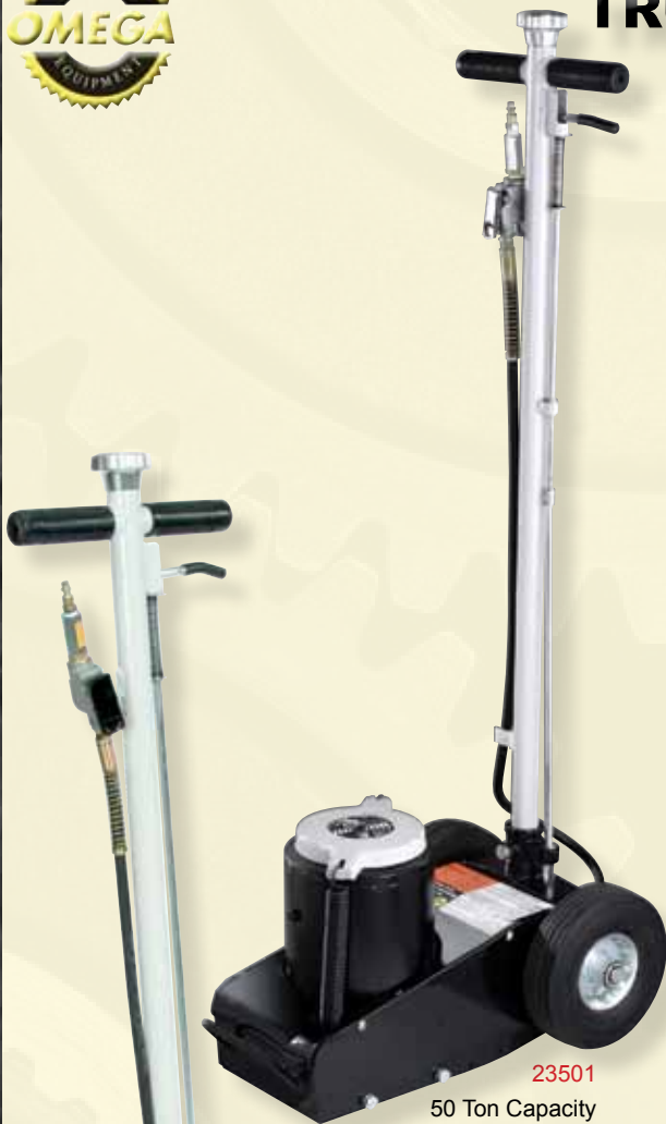
23501 50 Ton Capacity

Fingertip remote control for added safety