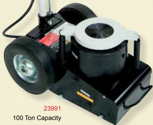
23991 100 Ton Capacity