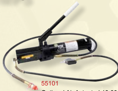
55101 Optional Air Actuated 10,000 PSI Hand Pump comes with dual control oil pump, U.S. patent No. 5,445,505