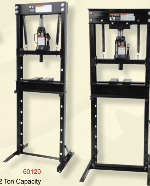
60120 12 Ton Capacity