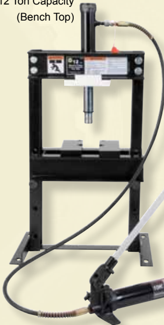
65123 12 Ton Capacity (Bench Top)