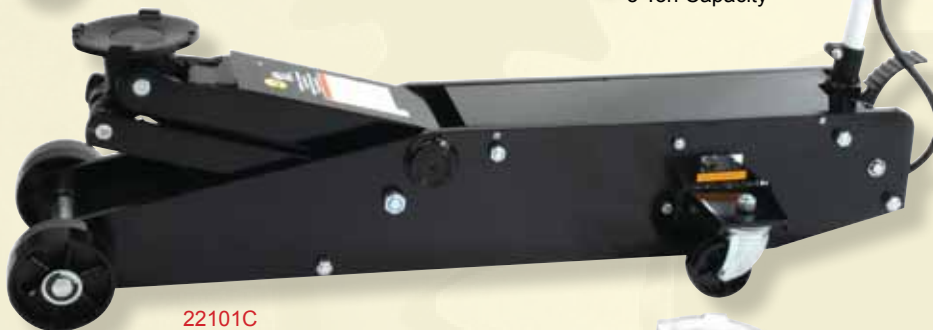
22101C 10 Ton Capacity