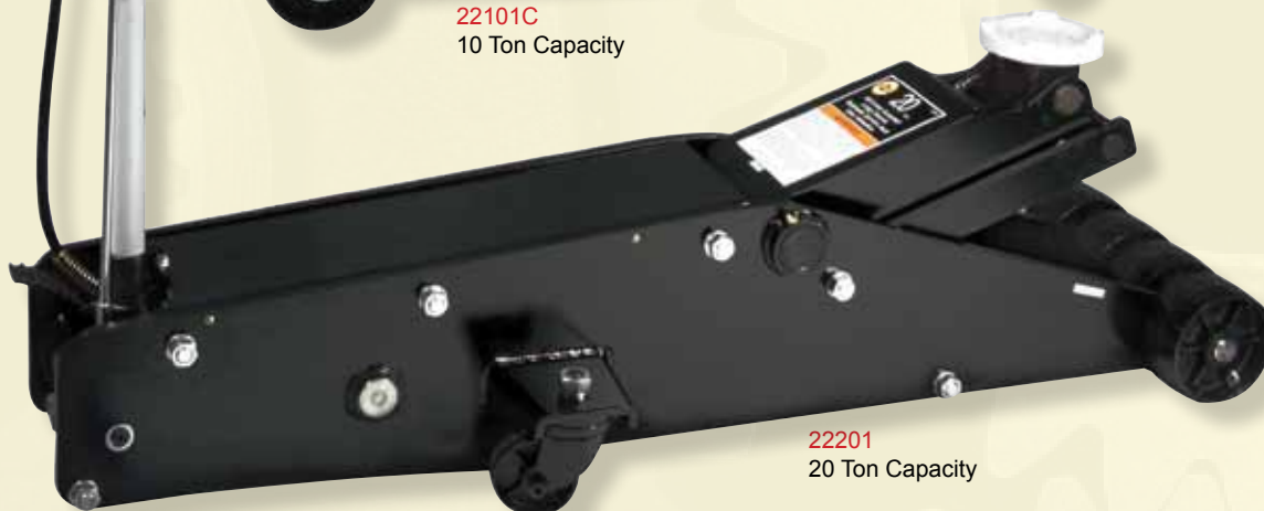
22201 20 Ton Capacity

FAST & SAFE! Convenient foot pedal designed for fast , no load lifts.